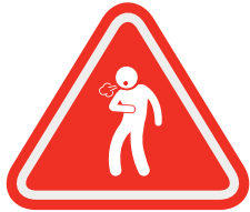
Shortness of Breath